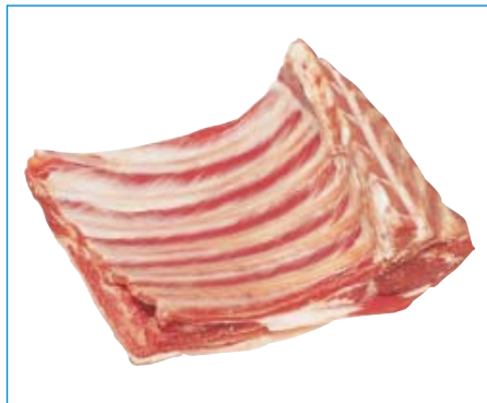
RACK - H.A.M. Code: 4931