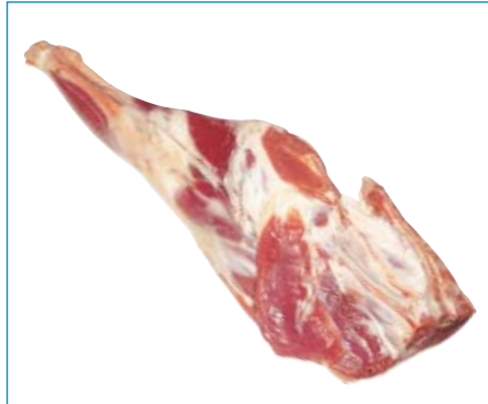
LEG - CHUMP ON - H.A.M. Code: 4800

Note: Goatmeat primal cuts and H.A.M. code numbers are the same reference as Lamb / Sheepmeat primal cuts and descriptions.