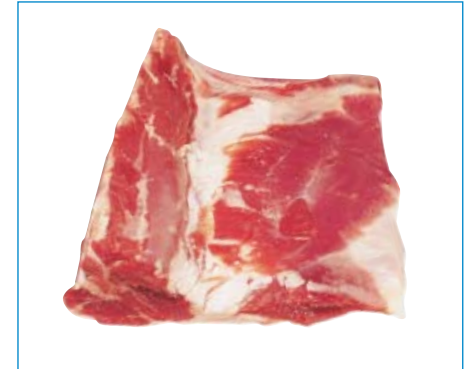
SHORTLOIN - H.A.M. Code: 4880