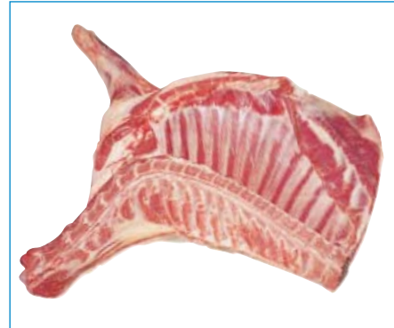
FOREQUARTER - H.A.M. Code: 4969