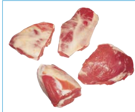
LEG CUTS - H.A.M. Code: 5065